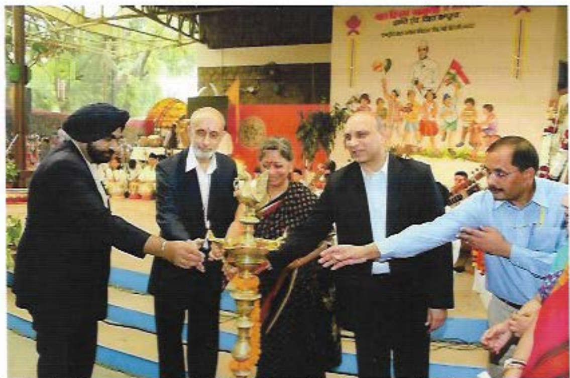
Member children welcomed Dr. Raju with song 'Padharo maro desh'.

This year function was inaugurated by Minister of Human Resource Development Dr. M.M. Pallam Raju in presence of more than four thousand children including children from BBK's, JBB Mandi, children from deprived sections of society, guests and teachers.